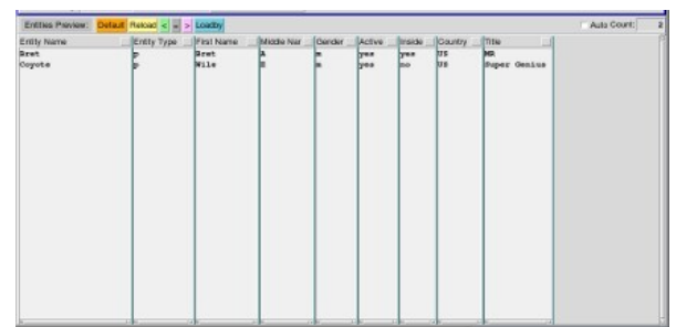
Illustration 1: Standard Dbp Widget